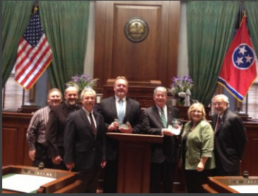
Senator Randy McNally (R-Oak Ridge, District 5)